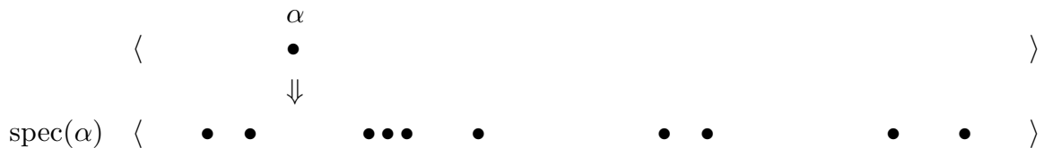
Figure A. Each real number \alpha determines \text{spec}(\alpha) , a countably infinite subset of the reals.